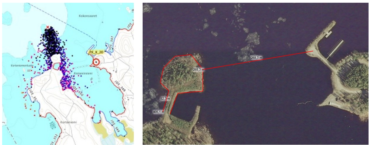
Figure 1. Incident scenario illustrating the oil drift modeling and shoreline contamination. The colours represent the extent of the spreading in given time intervals. On right hand side, the location of the Incident Command Post. (Graphic: J.Kauppinen, maps: ©Liikennevirasto, ©Maanmittauslaitos, ©Boris)

In order to assess the applicability of the RPAS technology in oil spill response operation, the North Karelia Fire and Rescue Service, the Kymenlaakso Fire and Rescue Service and the South-Eastern Finland University of Applied Sciences carried out a RPAS field test in May 2017. The test took place near the city of Joensuu in eastern Finland. The test scenario was based on a nearshore barge incident resulting in shoreline oil contamination. An oil drift calculation model was applied in order to predict the spreading of the oil (See Fig. 1). The aim of the test was to assess the actual extent and the degree of contamination of the oiled shorelines. No real oil was used. Degrees of oil contamination were demonstrated with objects of various sizes, such as tarpaulins and canisters, as shown in Fig. 2. Also plastic decoy-ducks were used to represent oiled birds. There were eleven (11) target objects in total placed within the shoreline that was 400 metres in length.