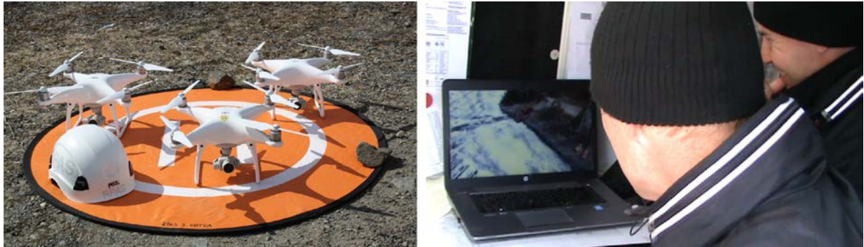
Figure 3. DJI Phantom 4 quadcopters used in the RPAS field test and the analysing of RPAS generated data at the Incident Command Post.

The reconnaissance survey on foot was executed by three trained firemen implementing an established protocol with reconnaissance maps and data sheets. The shipboard surveillance was carried out onboard an air cushion vehicle (due to ice coverage). The aerial surveillance was implemented with DJI Phantom 4 quadcopter (see Fig. 3) with maximum speed of 20 m/s and a flight duration of 20-40 minutes. Quadcopter was instrumented with a daylight camera providing 12 Mpix photos and 4K videos. Both manual and automated flight modes were tested, and the data was shared with the Incident Command Post through live streaming and by sending screenshot photos via email during flights, and by transferring original photos from the SD Card after landing.