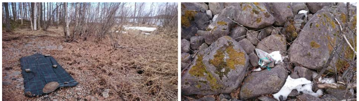
Figure 2. Target objects representing stranded oil (on left) and oil contaminated birds (on right).

An Incident Command Post was established at the nearby marina at a distance of 300 metres to the cape subjected to on-site reconnaissance surveys (Fig 1). Incident Command Post consisted of a command unit vehicle with management, communication and documentation systems managed by two executive fire officers.