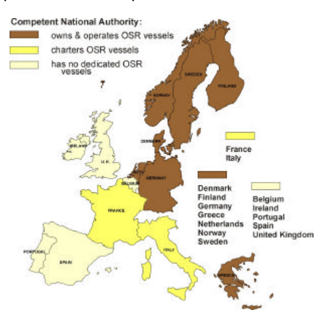
Map 3: Ownership models for OSR vessels available to national authorities in Europe

For the sake of convenience in comparison, one can look at three basic (though arbitrary) size classes of response vessels, those 20-40m in length, those from 40m to 80m and those greater than 80m. Table 2 and Map 4 below offer a 'snapshot' of the vessels currently available in Europe, including the vessels described above that are more or less under the direct control of the competent national authorities as well as oil spill response vessels from the private sector. The vessels considered here are either primarily dedicated to oil spill response or have this as a secondary role in addition to their primary role (e.g. dredgers, emergency towing vessels, research vessels). For the