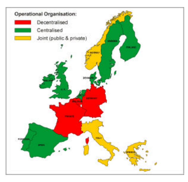
Map 2: Operational Organisation in Europe

Another way to look at the leadership models used in Europe for at-sea response is to summarise by the degree of centralisation at the operational, rather than the political level. In other words, is there one response organisation that is mobilised for incidents throughout the entire country, is a more regional (i.e. decentralised) approach taken or, finally, is the oil spill response task shared jointly with industry?