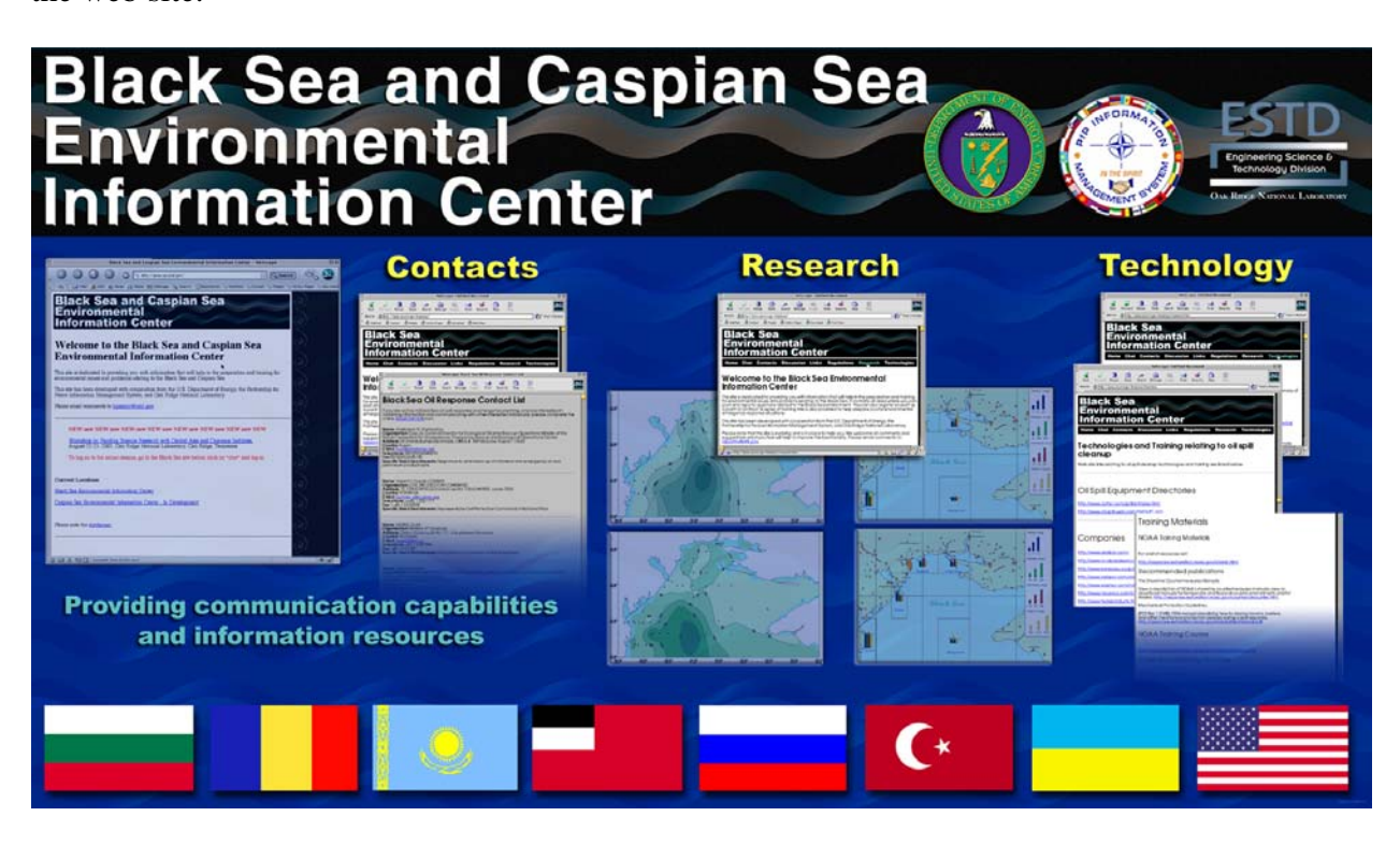
Figure 1: Poster graphic highlighting the web site

register on the web site to promote their technologies, services or research activities. To date, nearly 100 organizations have registered and participant's results of 10 workshops are posted on the web site.