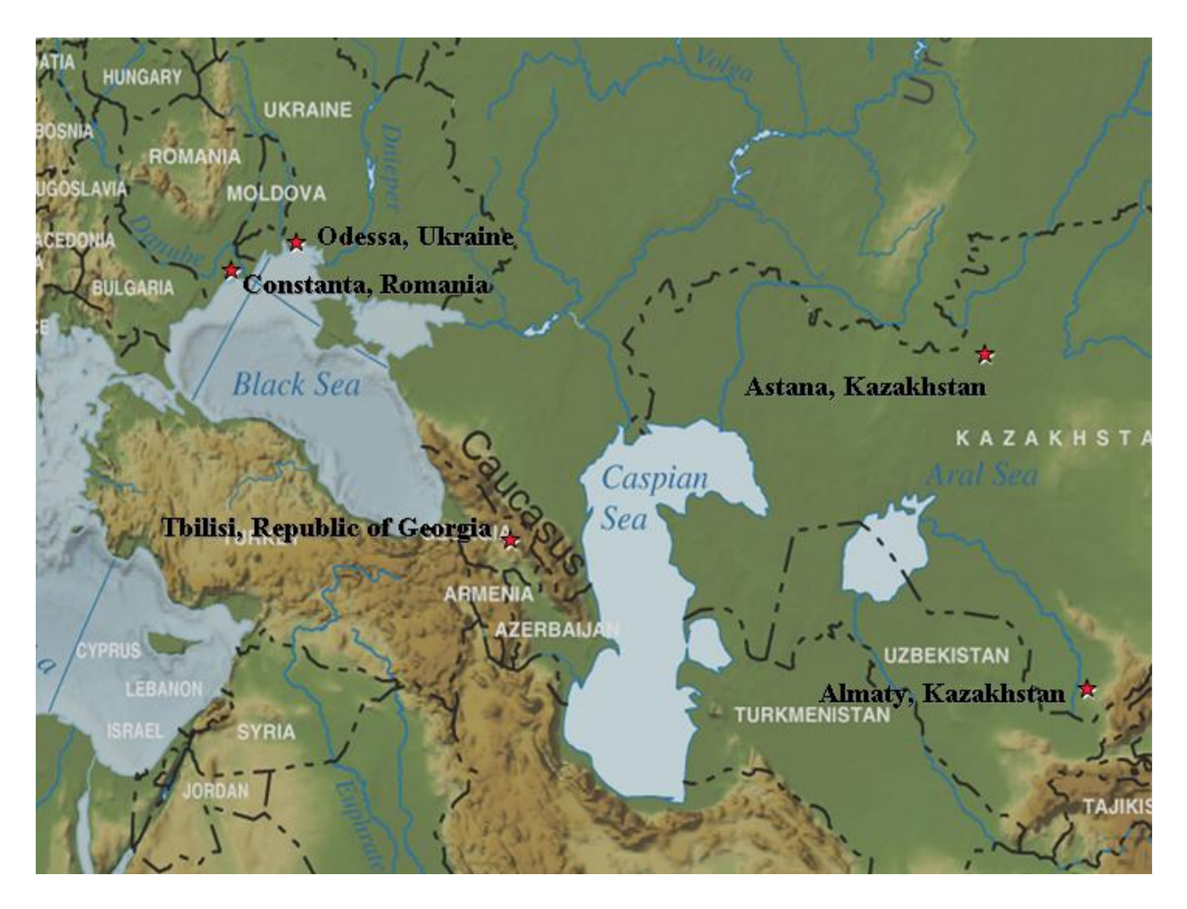
Figure 3: Location of workshops in Black Sea and Caspian Sea regions.

These workshops have been an important effort by DOE to bring together representatives from the region, oil companies, and other organizations to accelerate the dialog on environmental issues and to facilitate the creation of a regional capability to respond to oil spill threats on the Black and Caspian Seas. The workshops give countries of the region an opportunity to meet, discuss progress and current research initiatives presently under way. The progress made by these countries is very impressive. Almost all have completed a draft or published national oil spill emergency response contingency plans.