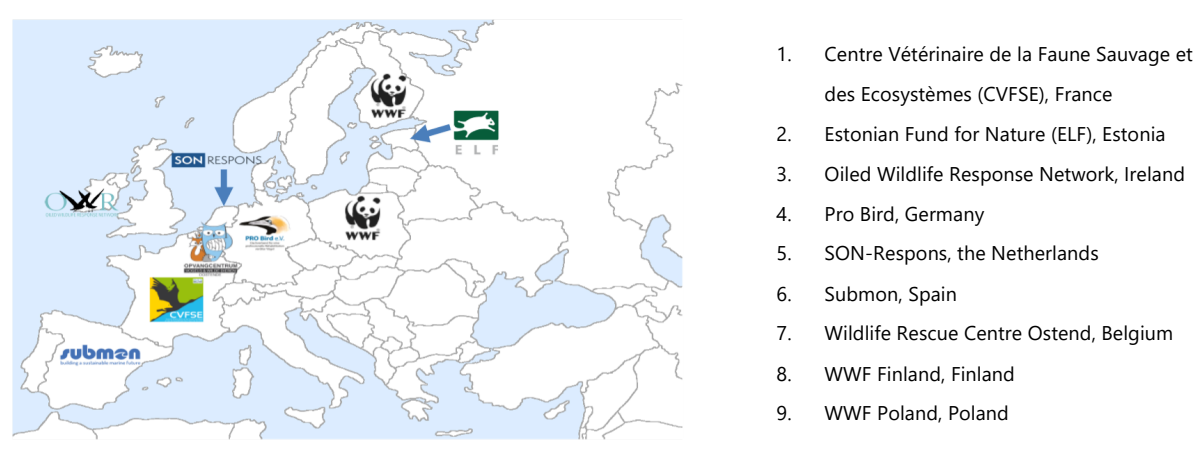
Figure 1 – EUROWA Network Member Organisations

EUROWA network is currently made up of 9 organisations in 9 European countries (see Figure 1), as well as a number of technical experts who form part of the pool of expertise. The Secretariat of the network is provided by the Sea Alarm Foundation.